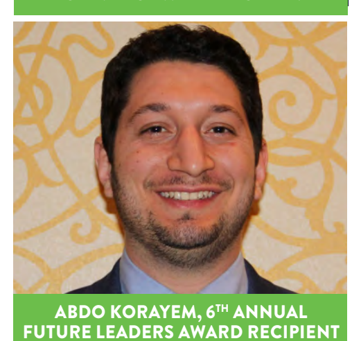
SEE MORE ON PAGE 18